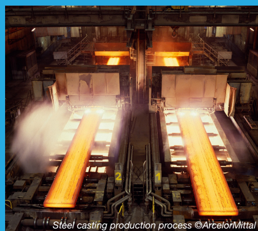
Steel casting production process

COORDINATOR: Acondicionamiento Tarrasense Asociación (LEITAT), Spain